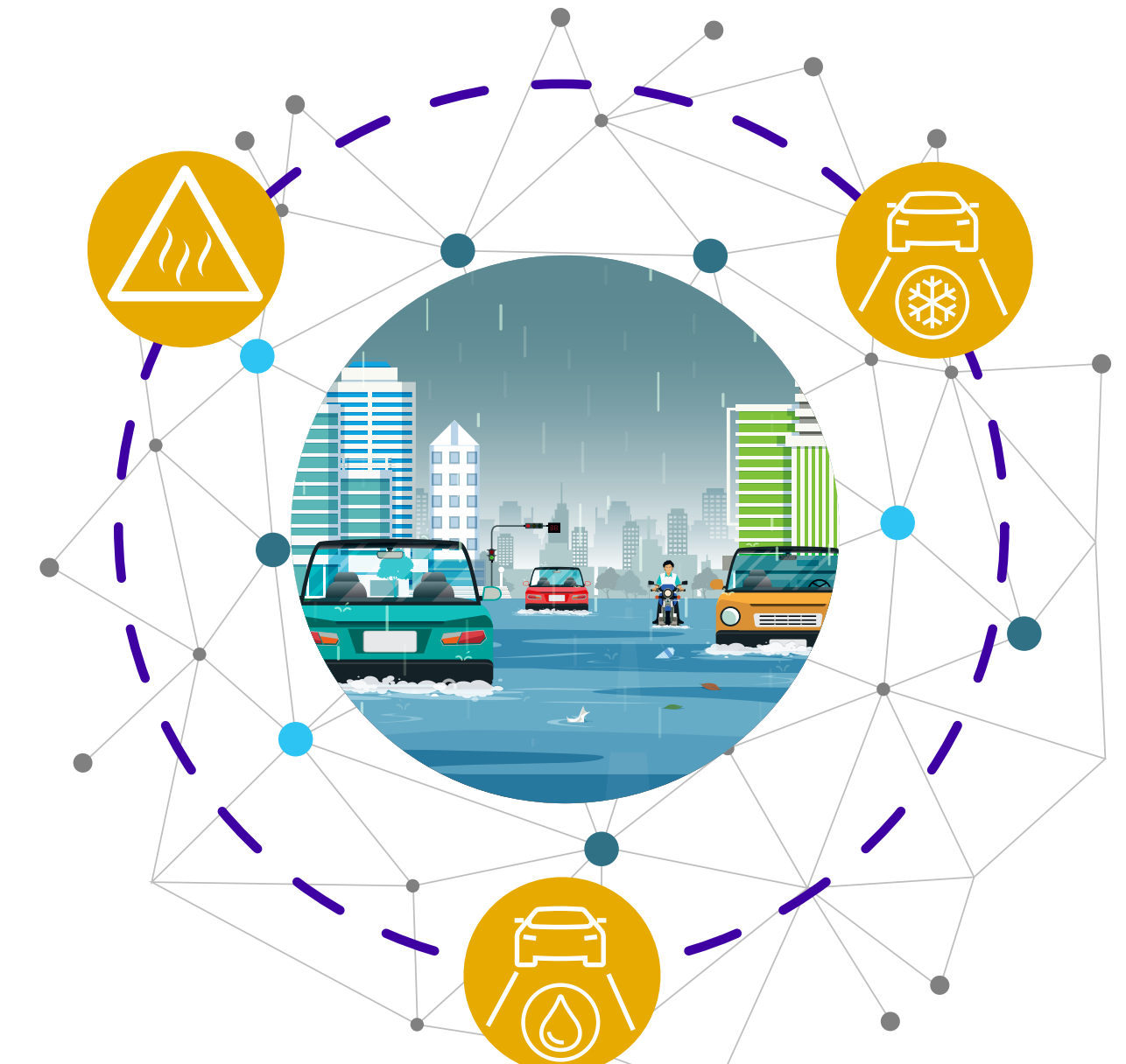
Low Visibility and Adverse Weather Conditions