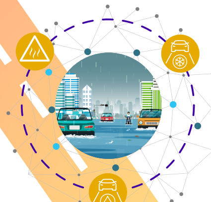
Low Visibility and Adverse Weather Conditions