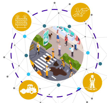
Non-Standard and Unstructured Road Conditions